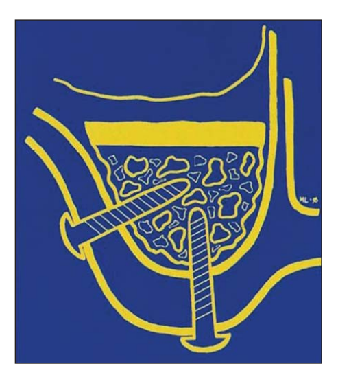
Fig 2 Fig 2 Two-stage surgery; technique where bone graft is fixed with osteosynthesis screws.

The aim of this study was to analyze the clinical outcome of implant treatment in patients with partially dentate maxillae who were treated with block bone grafts prior to or in conjunction with implant treatment.