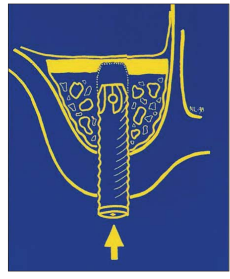
Fig 1 One-stage surgery; technique where bone graft is fixed with dental implants.